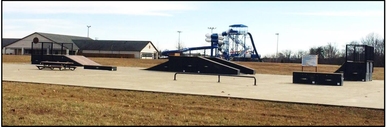
Skate Park in Somerset KY

A skate park is fairly inexpensive to install and requires very little maintenance once built and minimal supervision. It is also an activity that appeals to individuals who either are not interested in organized sports or may not have the means or the support to participate. The activity can be done in groups or individually and requires very little equipment, all of which can be purchased at a minimal cost. A bike and/or skateboard are all one needs to engage in this sport. Note: Helmets, knee pads and elbow pads are normally not required at most public skate parks but are highly recommended.