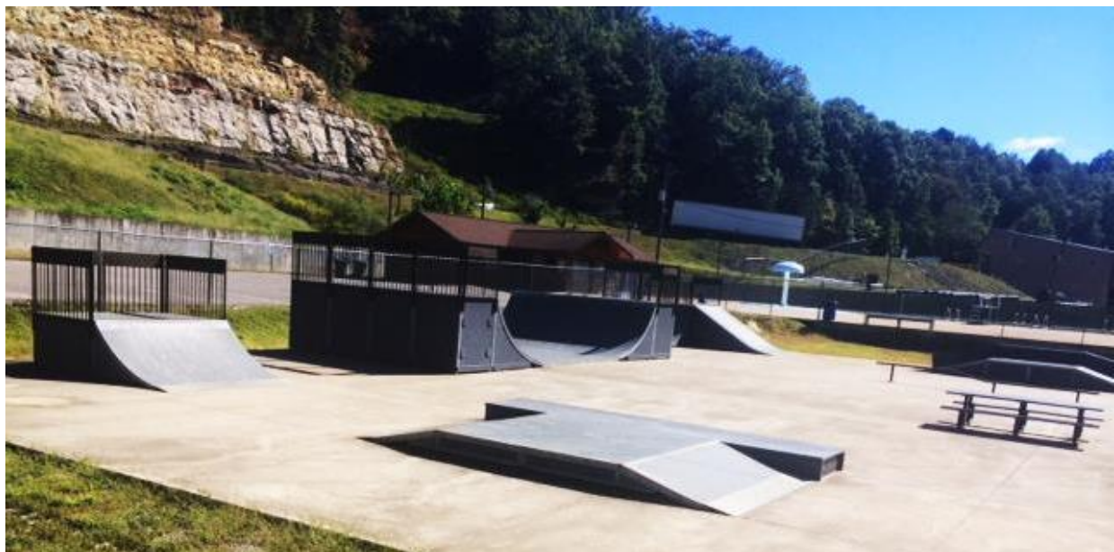
Knott County Skate Park in 2015

Knott County Fiscal Court built a “street park” design skate park in Hindman KY in 2006. The photos above were taken the day the skate park opened. The photo below taken in Fall of 2015 is how the skate park looks today. Very little maintenance has been done in the nine years since it was built and yet it is in use year-round. Many parents and community leaders will attest that the skate park is extremely popular and has provided a much needed recreation outlet for the youth in their community. Having a sanctioned site also greatly reduced the conflict of skateboarders using both private and city property to hone their skills.